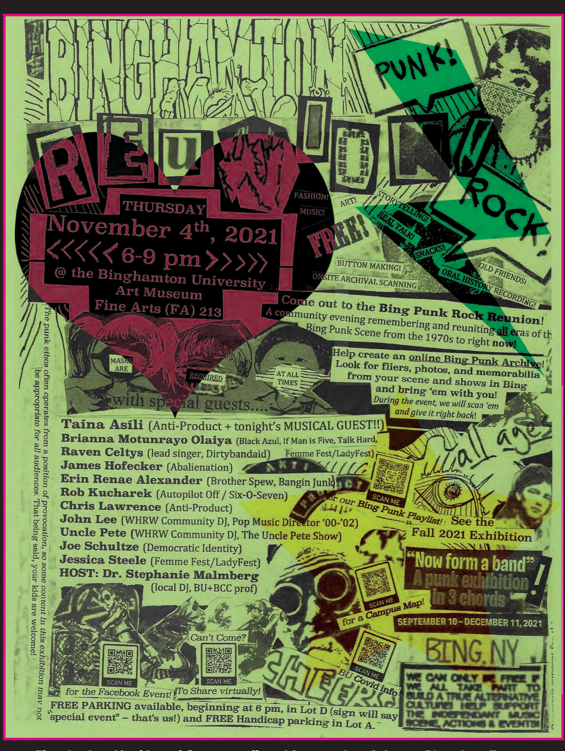
Flyer by Jennifer (Jenny) Stoever, collaged from copies of vintage Bing show flyers